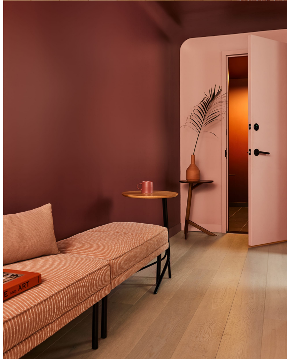
NYC Showroom - Wellness Hallway features Laugh Lines